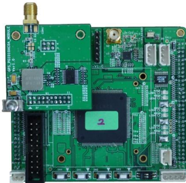
< Special Purpose GPS Module Photo >